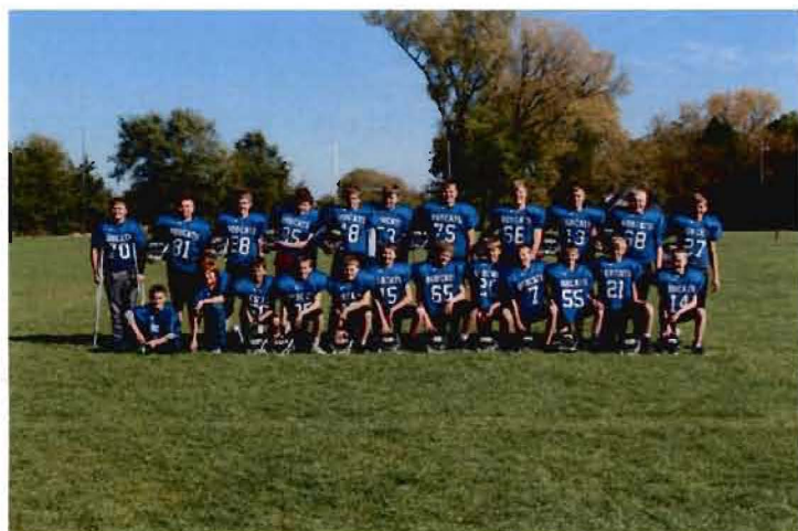
7 th and 8 th Grade Football