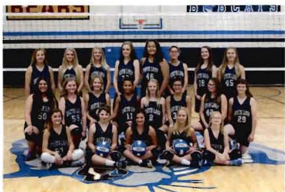
7 th Grade Volleyball