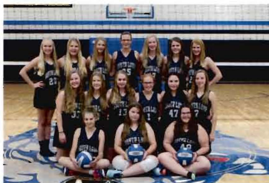
8 th Grade Volleyball