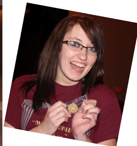
The Callaway High School Speech Team competed in tour-

naments in Broken Bow, Ord, North Platte, Gothenburg, and Loup City during the regular season, earning many medals and superior ribbons at each meet.